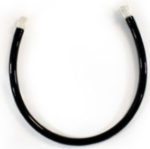
1 ft. NIBP Air Extension hose 570-0025-01