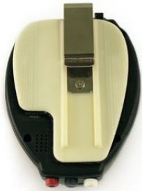
WVSM Velcro™ belt clip 406-0005-01