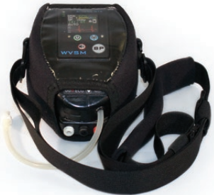
WVSM Protective Neoprene Cover with Shoulder Strap 570-0024-01