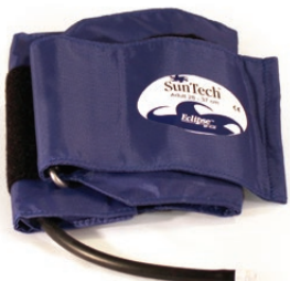
All purpose D-Ring BP cuff (Adult) 570-0023-02