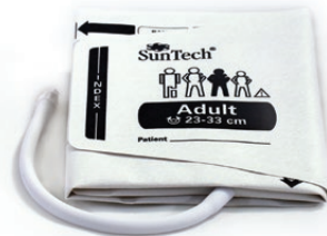
Disposable BP cuff box of 20 (Adult small cuff size) 570-0010-01