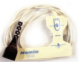
Disposable SpO2 sensor (box of 24) 570-0011-01