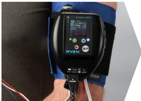
PATIENT WORN SMALL DEVICE

The ruggedized WVSM is ideal for patient monitoring in multiple emergency scenarios, both civilian and military. Lightweight portability enables live monitoring of vitals, from point-of-injury and throughout care.